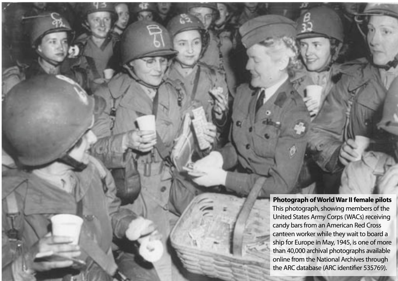
Photograph of World War II female pilots